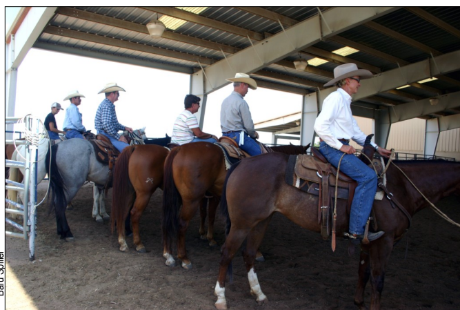
Clinic participants keeping cool in San Angelo