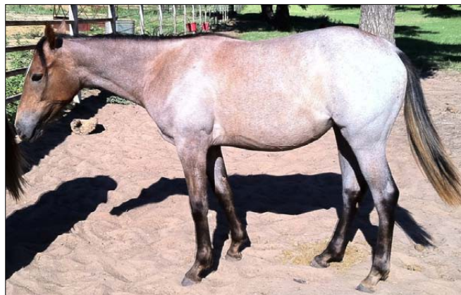
Add some color and class to your pasture with this year's raffle filly Bodelles Blue Boon

Huge thanks to Nonie Casselman-Reed and Touchstone Ranch Recovery Center for providing this wonderful prospect. Sign up now for your chance to own this beautiful filly.