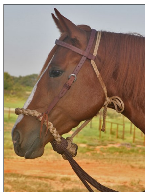
Popular items from DMTack.com include this style of loping hackamore