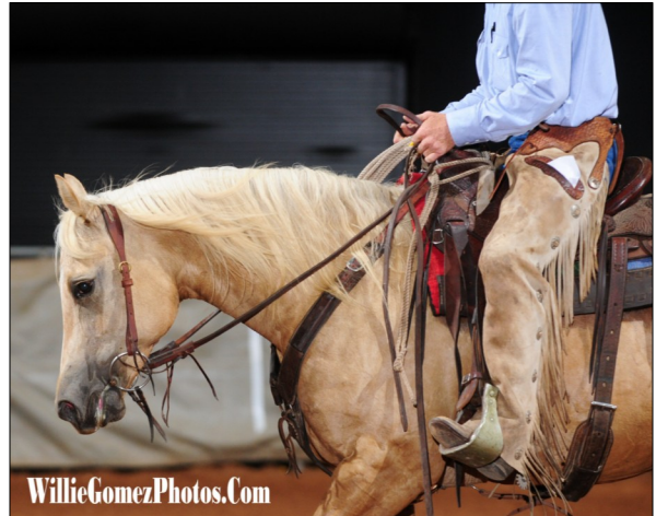
Championship titles and earnings are available to three, four, and five year-old stock horses

Come join the action or cheer for your favorites November 17-20, 2011 at the Brazos County Expo in Bryan, Texas.