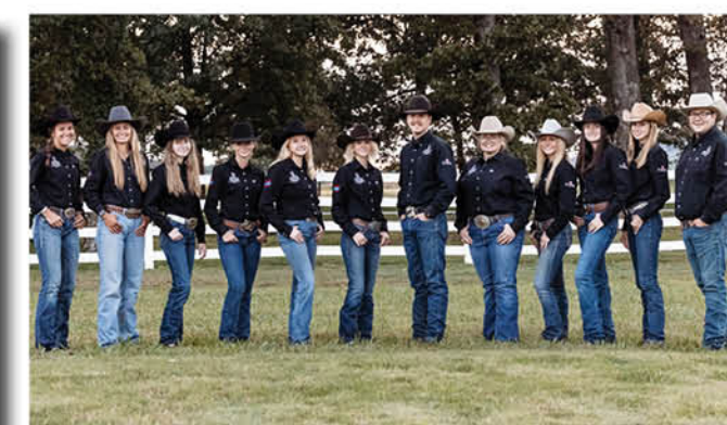
Collegiate Division II Team University of Arkansas