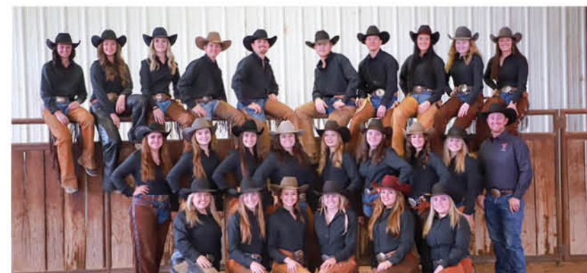
Collegiate Division I Team Texas Tech