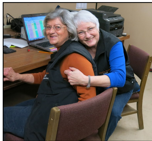
Can you feel the love? SHOT Secretaries are ready for 2013!