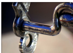
SPILLER SPURS AND BITS